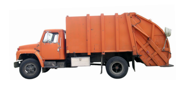
LOADED GARBAGE TRUCK 25 TONS