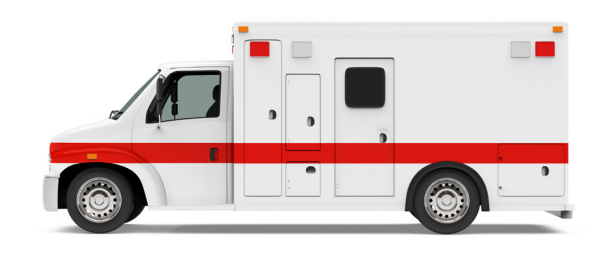
AMBULANCE 5 TONS