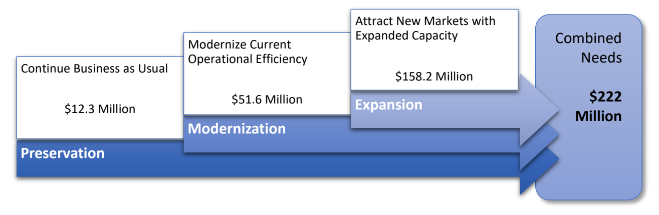
Figure 2: Riverport Investment Scenarios

The reasonableness of the investments recommended by the ports in the port visits and subsequent dialogue is supported by the benefit-cost ratios (BCR), discussed further in Section 6 . While the focus of the current technical memorandum is overall funding levels, payoffs, and the rationale for investment, individual line items will be available as an appendix to the final report at the conclusion of the study. BCRs show that the investments identified by the riverport authorities yield benefits consistent with national standards expected for investments of the types and magnitudes identified for expansion, modernization, and preservation.