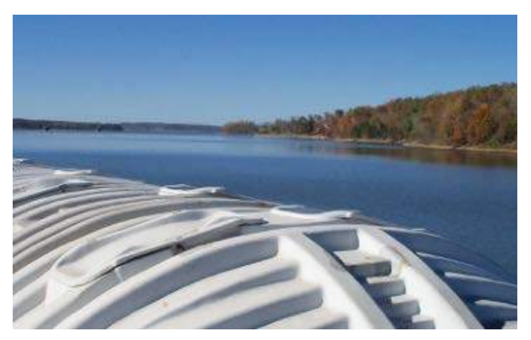
Figure 2-1: Covered barge at Eddyville Riverport

Changes in Kentucky's waterborne commodity mix, trading partners, and economic role can have profound implications for both the port communities and the "hinterlands" within a 90-mile one-way drive from the nearest public riverport. This chapter offers a detailed assessment of economic and market changes anticipated for Kentucky's waterborne economy to the year 2045, including key growth and decline markets for each port, significant shifts to expect in trading partners, ways that specific investments in Kentucky's public riverports can be responsive to this change, and how Kentucky's positioning for future change relates to practices of other states. Technical Memorandum 2 provides additional detail on these forecasts, both statewide and for individual port hinterlands. The remaining chapters of the study will then directly address the benefits and impacts of investing in riverports under these changing conditions, key actions to support market capture, and strategic objectives for implementing a riverport hinterland investment and market strategy to 2045.