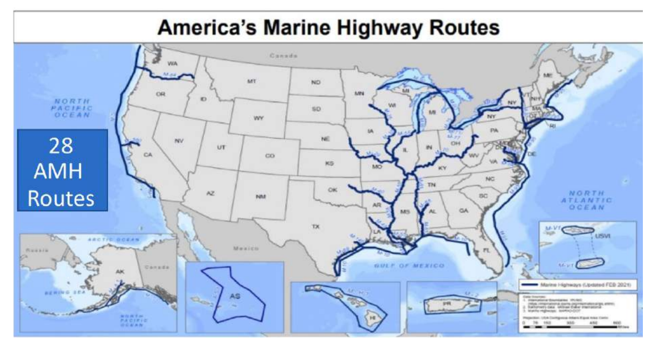
Figure 2-3: Map of America's Marine Highway Routes

Once that application has been approved to be designated as a Marine Highway Project, that project becomes eligible to apply for Marine Highway Grant funding. Facilities in both Paducah and Brandenburg have been recipients of these grants in years past. The program was founded under the Clean Energy Act ; so public benefits gained from funded projects are calculated, such as the number of truck-miles traveled that are removed from the highways as well as reductions in road maintenance, carbon emissions, congestion, and fatalities.