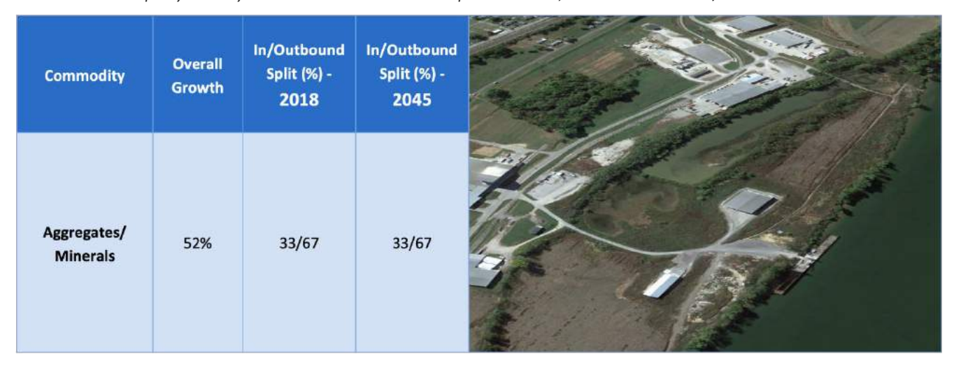
Table 2-10: Greenup-Boyd County Waterborne Commodities— Expected Growth, Current and Future In/Outbound Shares

Aggregates and minerals are expected to grow as a key market for Greenup-Boyd. In addition to the commodities currently handled at Greenup-Boyd shown in Table 2-10, the overall hinterland can anticipate growth in waterborne travel demand for metal and ceramic products and chemical preparations. While the aggregates shown in Table 2-10 represent concrete, other mineral products (such as gypsum and metallic ores) also may represent growth markets for this waterborne market (Appendix 2.2g). The market decline in coal and petroleum in the hinterland (forecast to decline by more than 14 million tons by 2045) highlights the importance of modernization to ensure efficient and cost-competitive operations for minerals and related growth commodities.