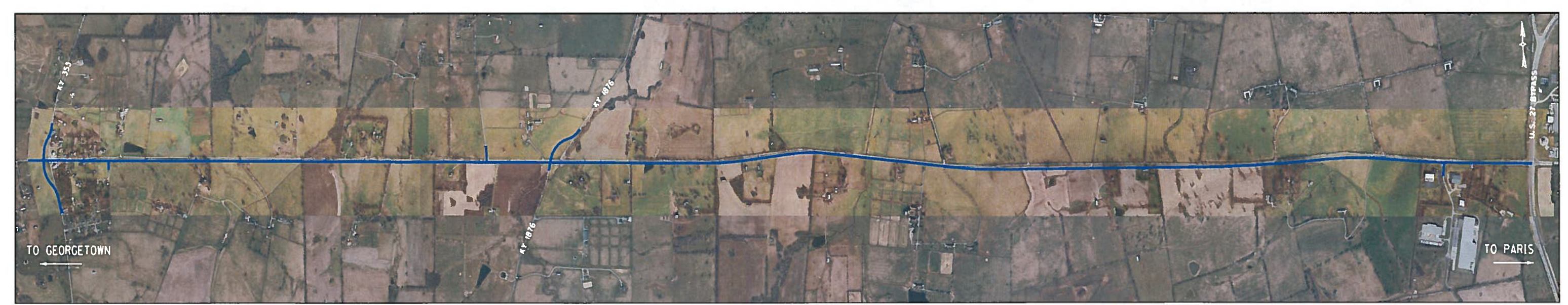
U.S. 460 ALTERNATE 2