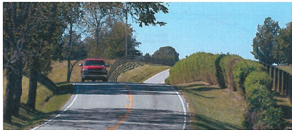
U.S. 460 LOOKING EAST