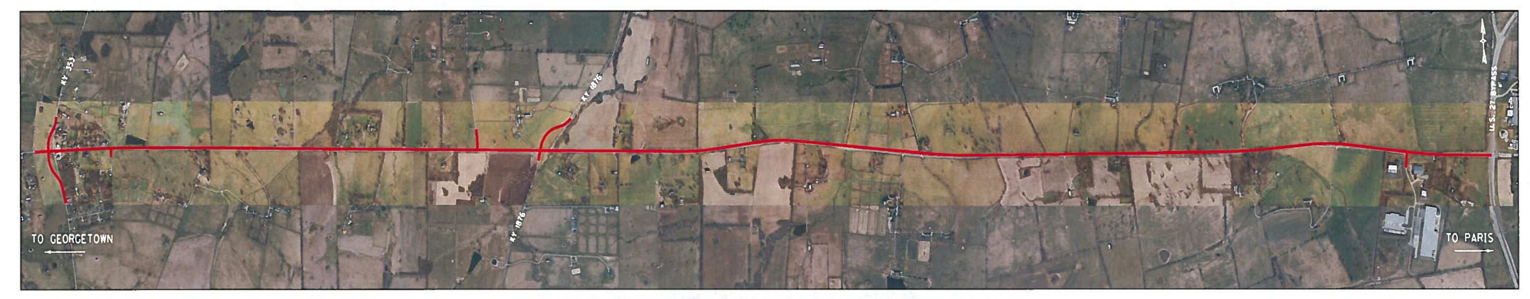
U.S. 460 ALTERNATE 1