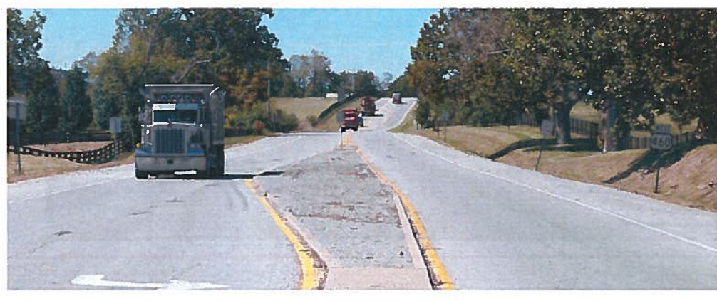
U.S. 460 @ U.S. 27 BYPASS LOOKING WEST