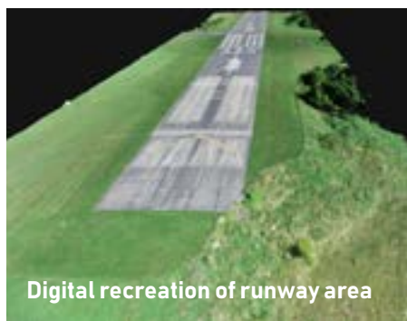
Digital recreation of runway area

Ashley Graves in District 3 preparing for a challenging job mapping a bridge in Todd Co. Trees can pose a problem for mapping missions requiring the pilot to maneuver around and under the tree canopy.