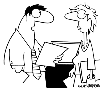
“The word ‘audit’ comes from ‘auditory’ which means ‘to hear bad news coming’.”

Post Audits – KYTC audits lump sum and cost plus contracts. Both lump sum and cost plus contract audits require that costs be allowable per contract and state and federal regulations and be supported by the appropriate documentation. The lump sum audit will result in a comparison of the costs negotiated to the actual costs incurred by your company for the project. The cost plus audit will result in a determination of the amount, if any, owed either by KYTC or your company.