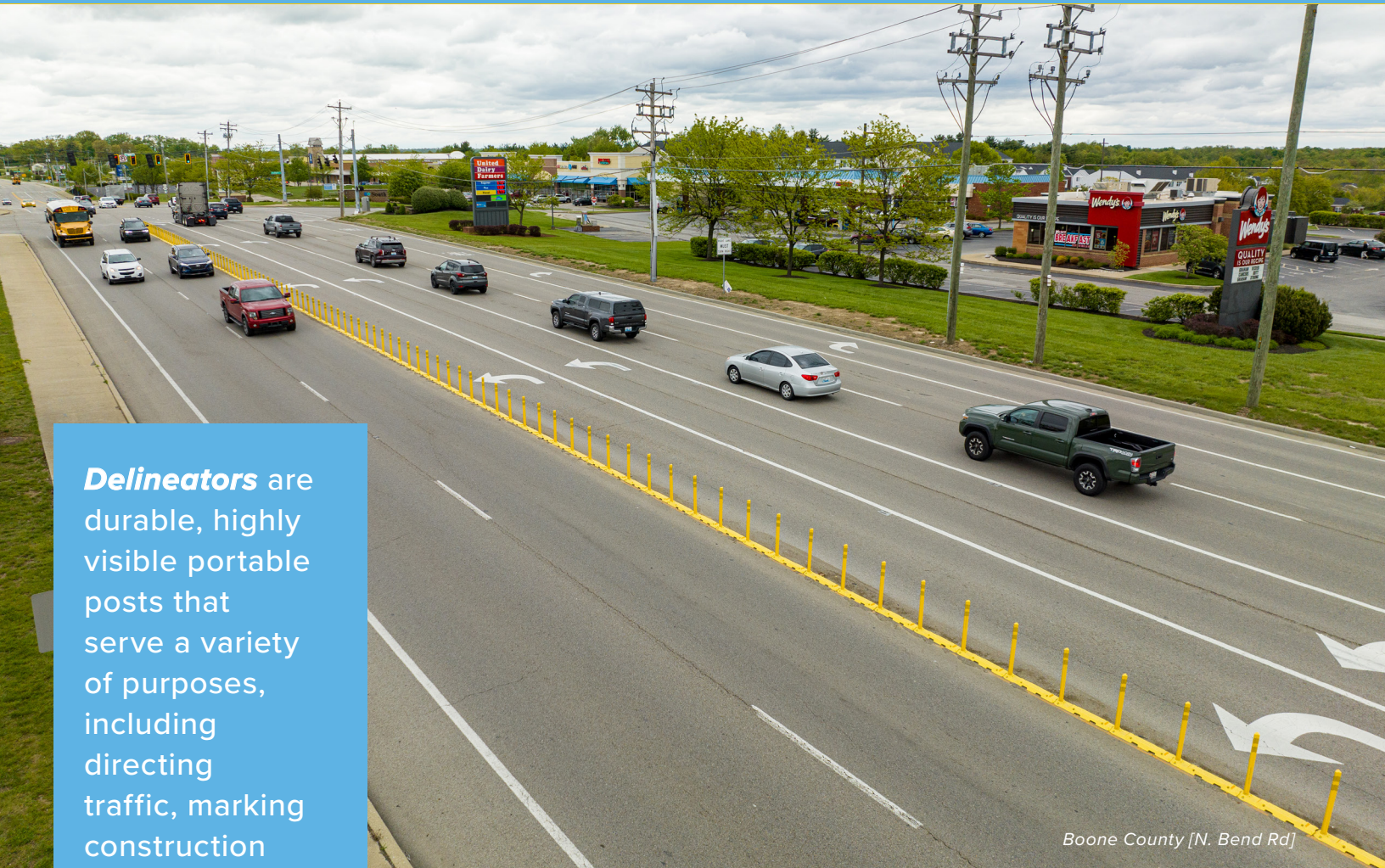
Boone County [N. Bend Rd]

Delineators are durable, highly visible portable posts that serve a variety of purposes, including directing traffic, marking construction zones or other temporary hazards, and guiding drivers through curves or other roadway features.