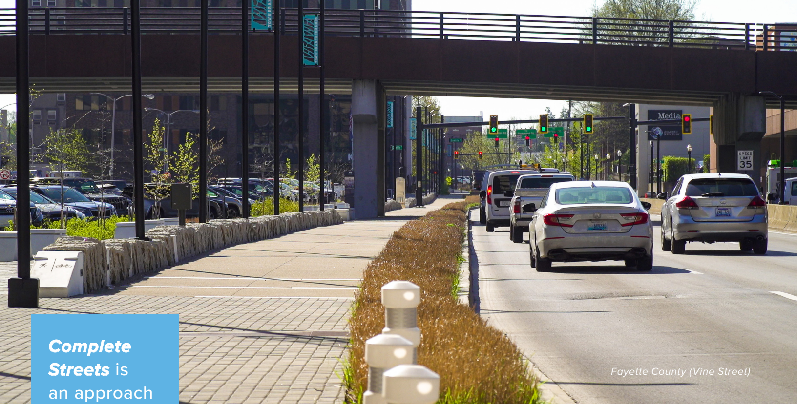
Fayette County (Vine Street)

Complete Streets is an approach to planning, developing and operating roads that are safe and accessible for all users.