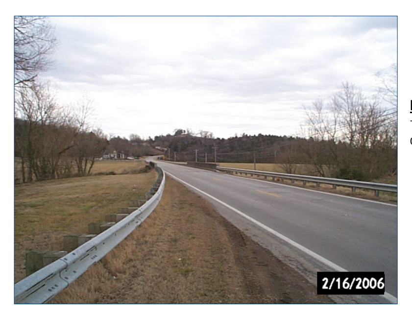
Photo 37 Typical section of eastbound KY 90 west of Grider. Sharp curve in background.