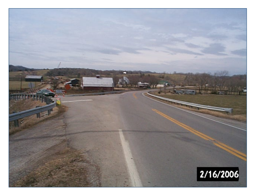
Photo 31 Westbound KY 90 and KY 100 intersection. Sharp curve, limited visibility, KY 100 intersects at an oblique angle.