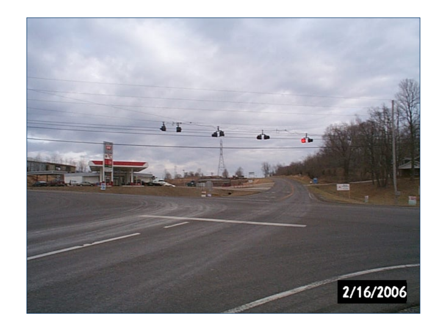
Photo 17 KY 90 / KY 163 intersection looking north, showing flashing traffic lights.