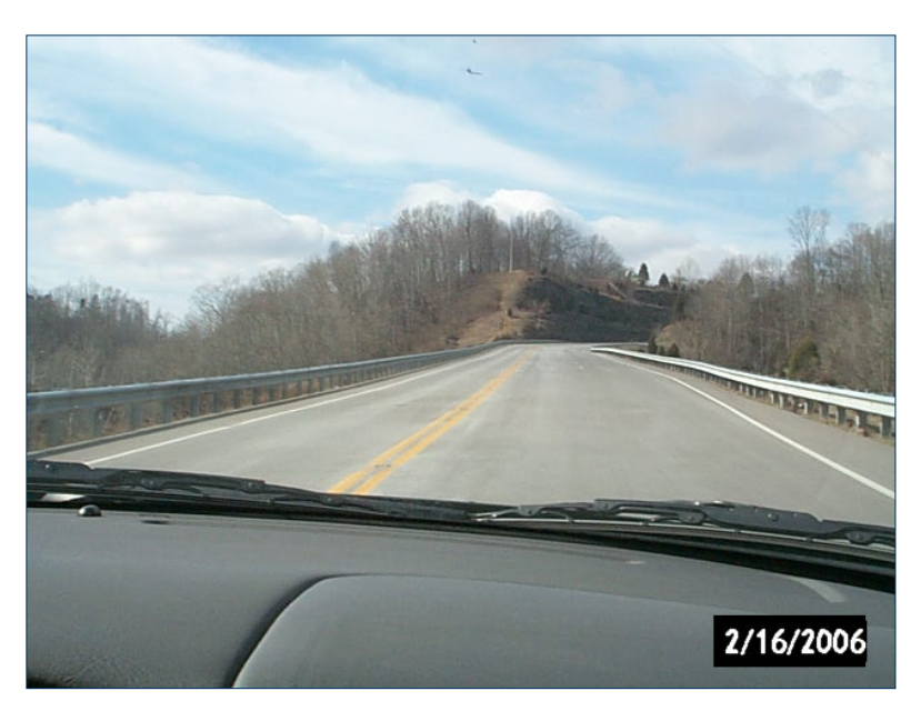
Photo 21 Westbound KY 90 east of Beaumont showing improved typical section with a passing lane.