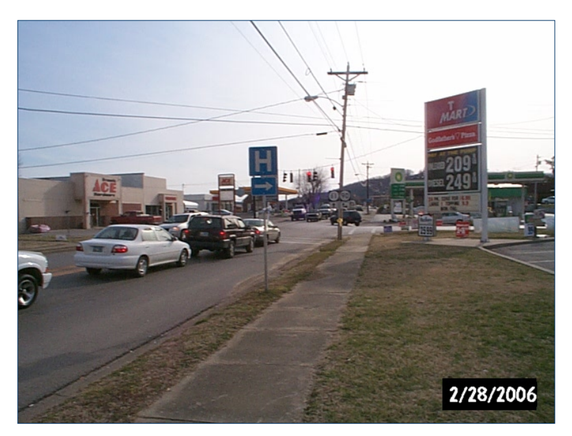
Photo 51 Southbound KY 61 at the KY 90 intersection in Burkesville.