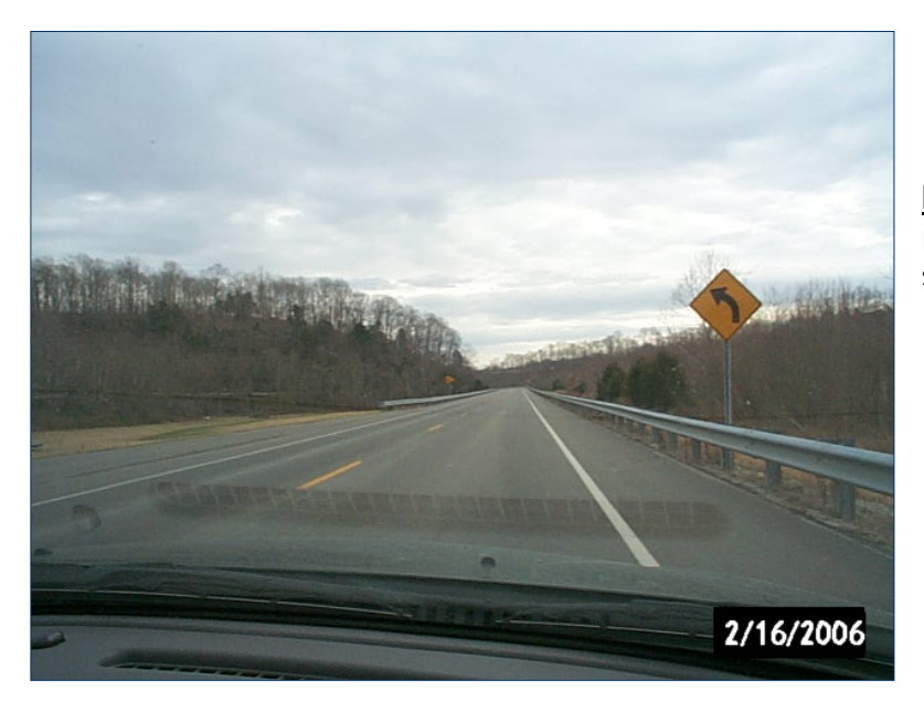
Photo 22 Eastbound KY 90 west of Willow Shade showing improved typical section.