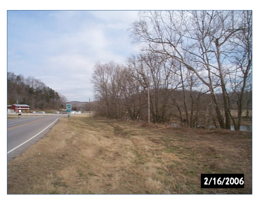
Photo 27 Eastbound KY 90 exiting Marrowbone showing Marrowbone Creek and floodplain.