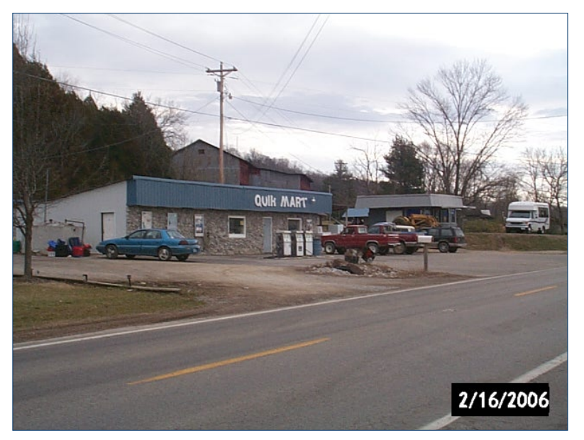
Photo 25 Quick Mart (possible contamination site number 10) in Marrowbone.

Eastbound KY 90 exiting Marrowbone. Area prone to flooding. Marrowbone Creek on right, sharp curve leading to Wisdom Creek Bridge in background.