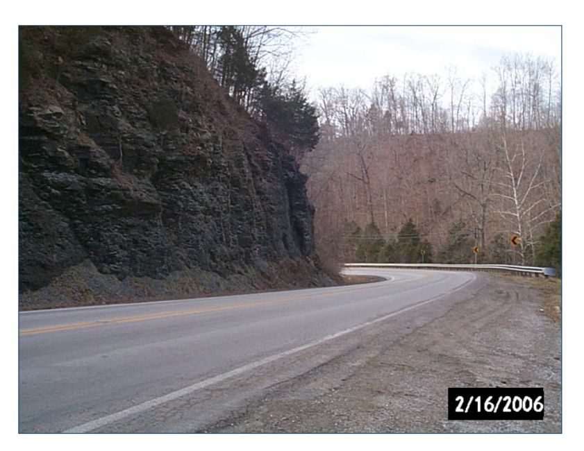
Photo 45 Westbound KY 90 on Burkesville Hill. Sharp curve, deep rock cuts.