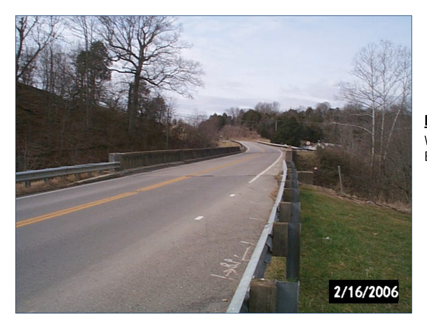
Photo 33 Westbound KY 90 at Dutch Creek Bridge. Sharp curve, limited visibility.