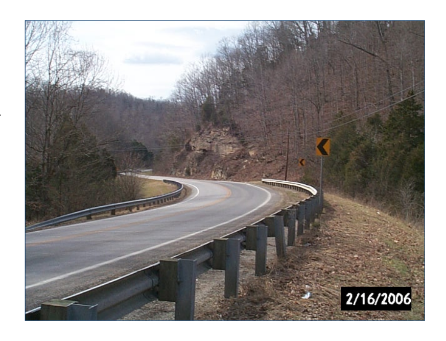
Photo 47 Westbound KY 90 on Burkesville Hill. Sharp curve, deep rock cuts.