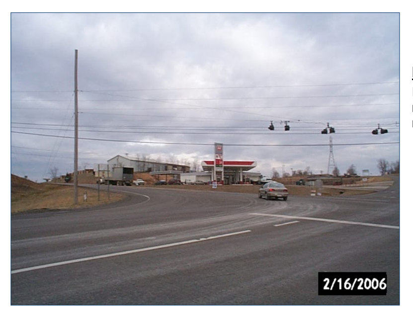
Photo 16 KY 90 / KY 163 intersection looking northwest. Possible contamination site number 6 in northwest corner.