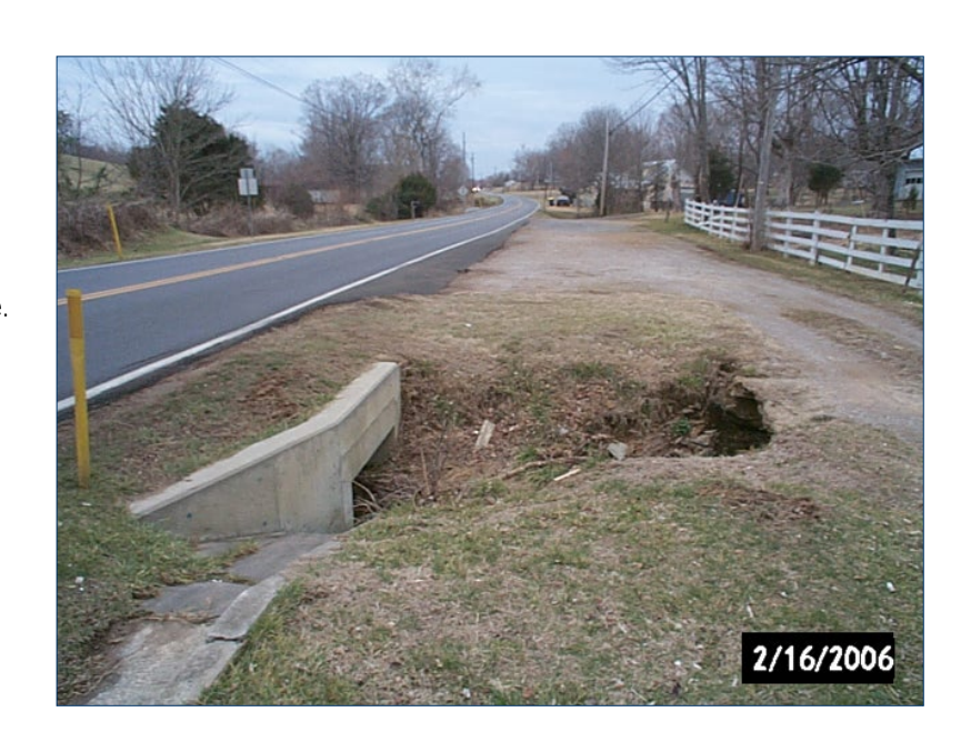
Photo 5 KY 90 in west Summer Shade with exposed culvert near pavement edge.

KY 90 in west Summer Shade with typical truck traffic.