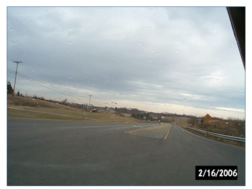
Photo 18 KY 90 eastbound at KY 163 intersection. Westbound KY 90 has center left turn lane.