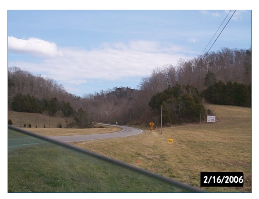
Photo 42 Eastbound KY 90 approach to Burkesville Hill Road/Saw Mill Cut. Sharp curve, uphill, limited visibility.