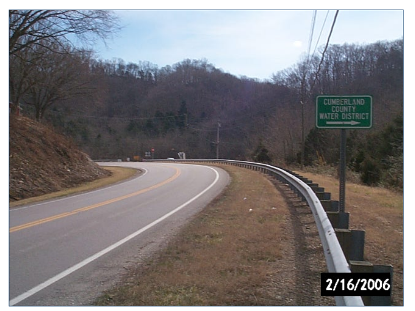
Photo 40 Eastbound KY 90 approach to KY 691 intersection. Sharp curve, downhill, limited visibility.