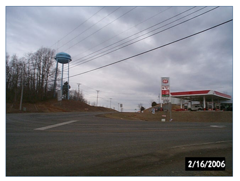
Photo 19 KY 90 / KY 163 intersection looking southwest. Possible contamination site number 6 in northwest corner.