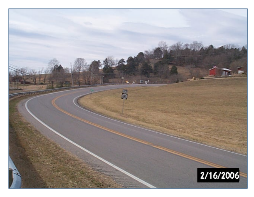
Photo 41 Westbound KY 90 approach to KY 691 intersection. Sharp curve, uphill, limited visibility.