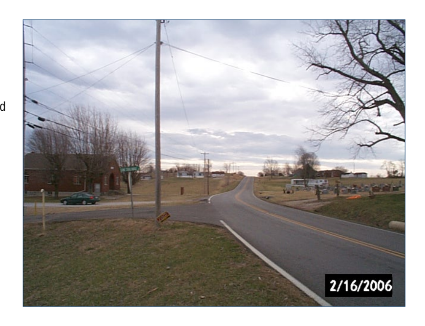
Photo 20 Eastbound KY 90 at Lone Star Ridge Road in Beaumont showing curve and limited visibility. Small cemetery on right.