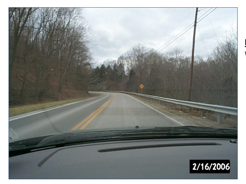
<u>Photo 43</u> Westbound KY 90 on Burkesville Hill.