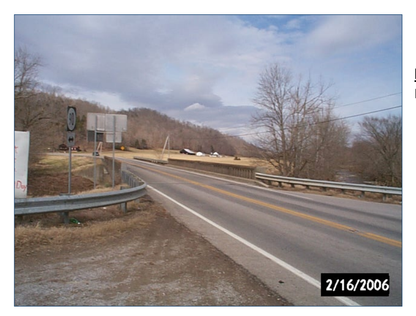
<u>Photo 28</u> KY 90 at Wisdom Creek Bridge.