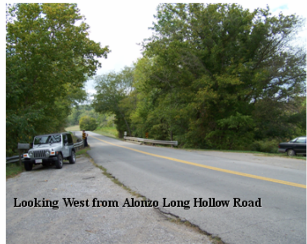
Looking West from Albino Long Hollow Road