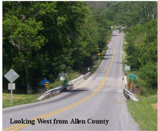
Looking West from Allen County