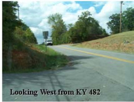
Looking West from KY 482