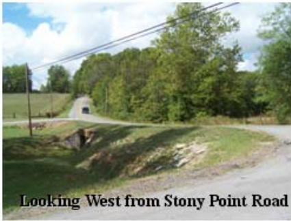
Looking West from Stony Point Road