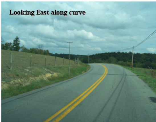
Looking East along curve