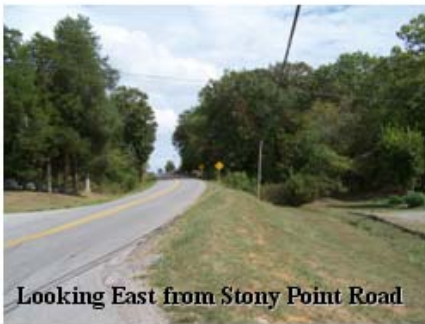
Looking East from Stony Point Road