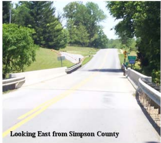
Looking East from Simpson County