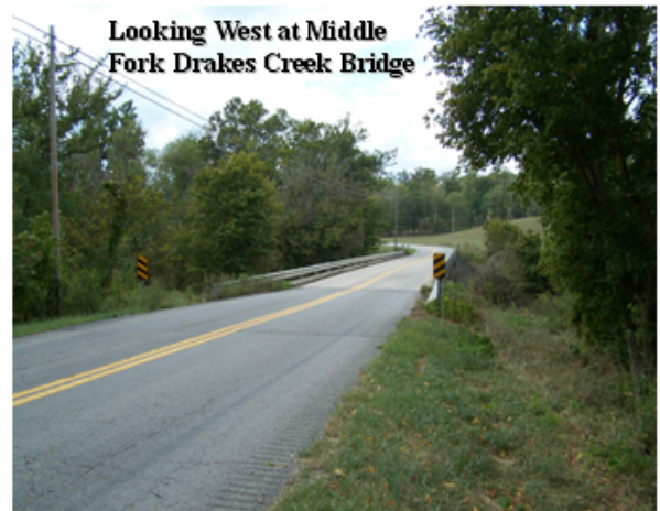
Looking West at Middle Fork Drakes Creek Bridge