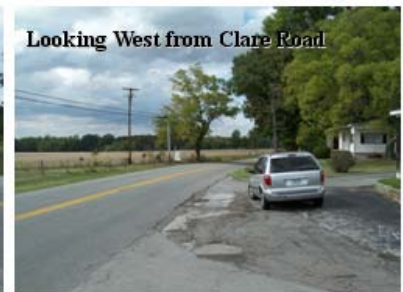
Looking West from Clare Road