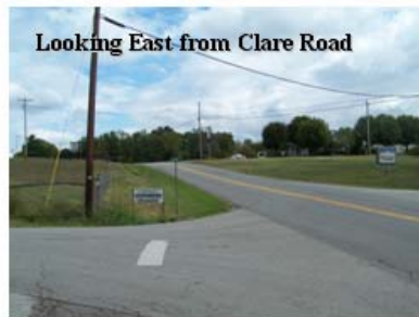
Looking East from Clare Road