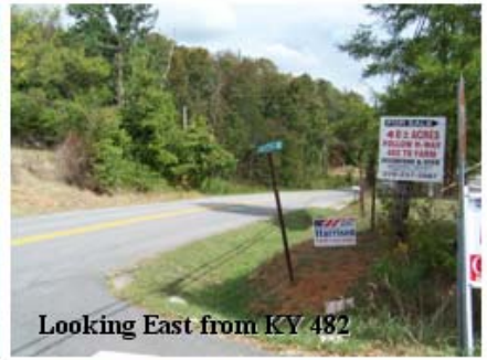
Looking East from KY 482