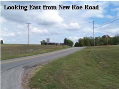
Looking East from New Roe Road