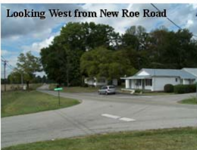
Looking West from New Roe Road