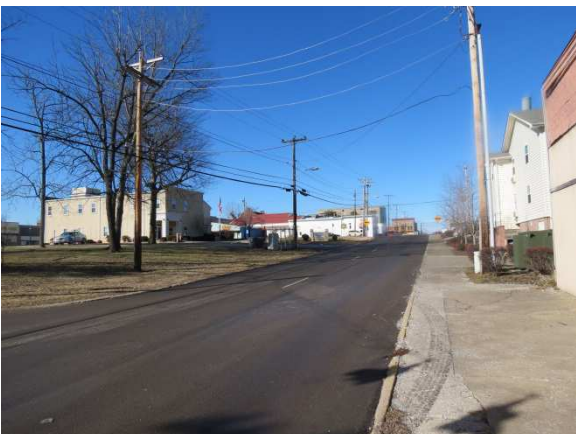
KY 91 (Market St) looking west towards downtown