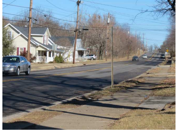
US 62 (N Jefferson St) looking north from Adsmore House