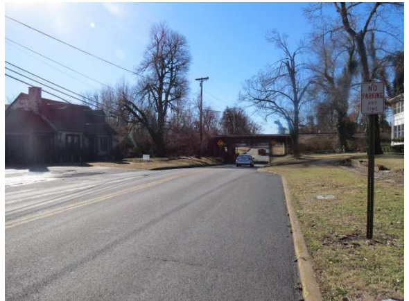
KY 139 (S Jefferson St) looking south to overpass