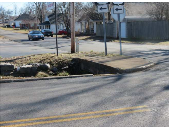
US 62 (N Jefferson St) looking southeast to ditch at Green St intersection