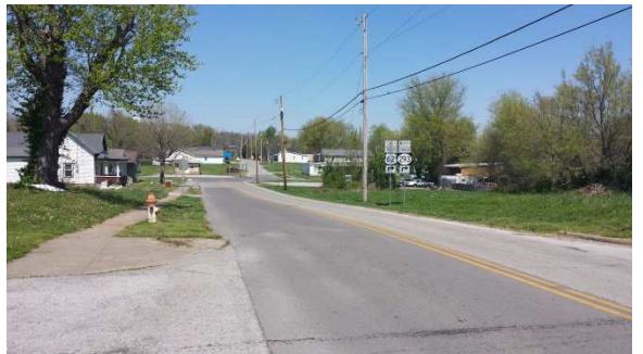
Local truck route along Seminary St looking north to Green St intersection