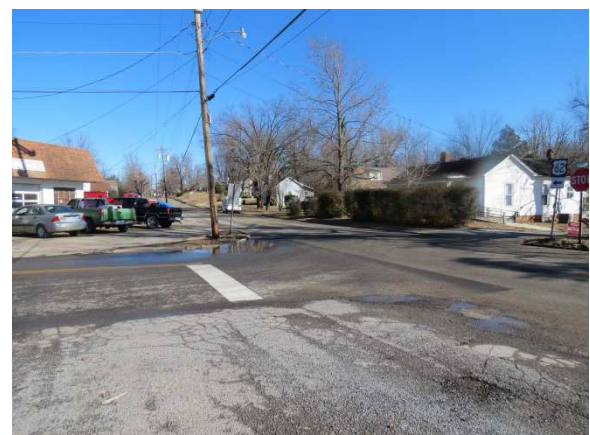
US 62 at McGoodwin Ave, looking northeast