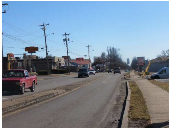
US 62 (Main St) looking southeast