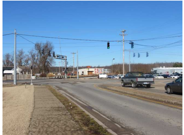
“Druthers Corner” or US 62 (Main St) at KY 91 (Marion Rd) looking northwest