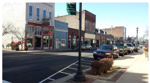
US 62 (Market St) looking west from courthouse sq