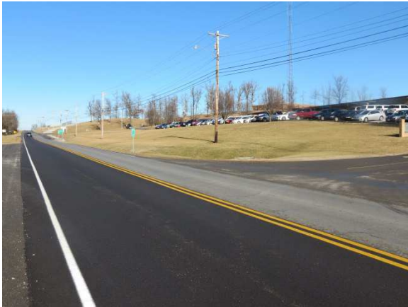
KY 91 (Marion Rd) at schools, looking north