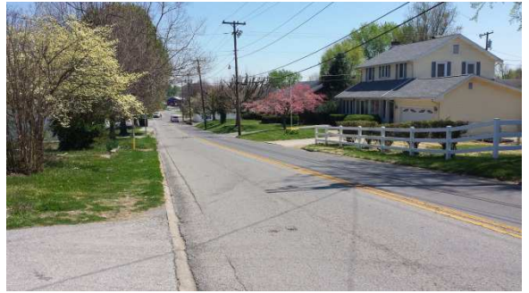
Local truck route along Legion St facing KY 139/KY 293 intersection