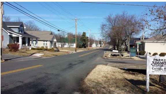
US 62 (N Jefferson St) looking north near Adsmore House