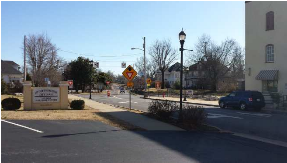
Looking southeast to "Five Leg" intersection at KY 91/Main St/Washington St