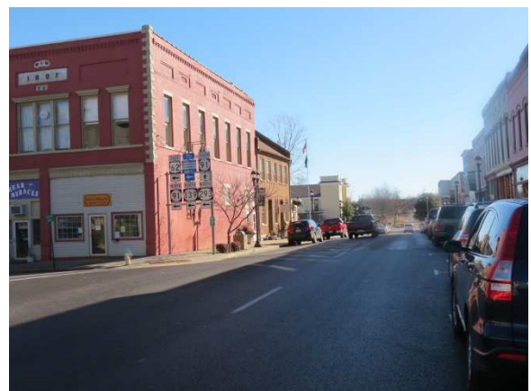
KY 91-1 (Main St) looking east from courthouse