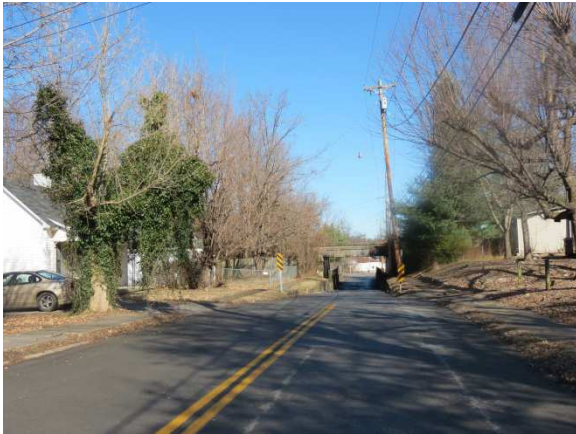
KY 2080 (Cadiz Rd) looking north to overpass