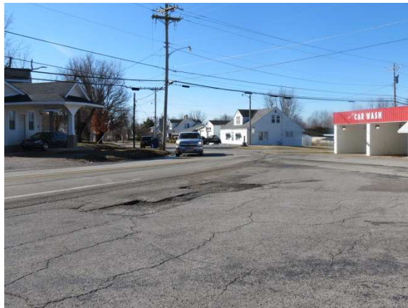
US 62 (Dawson Rd) looking southwest to KY 3114 (E Young St)