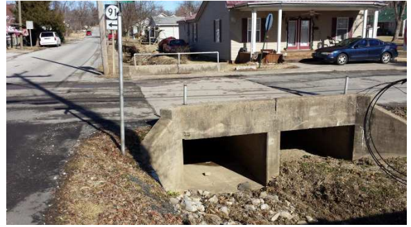
Drainage structure, Market St at Hawthorne St