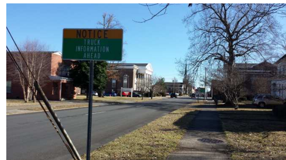
US 62 (Main St) looking east towards downtown