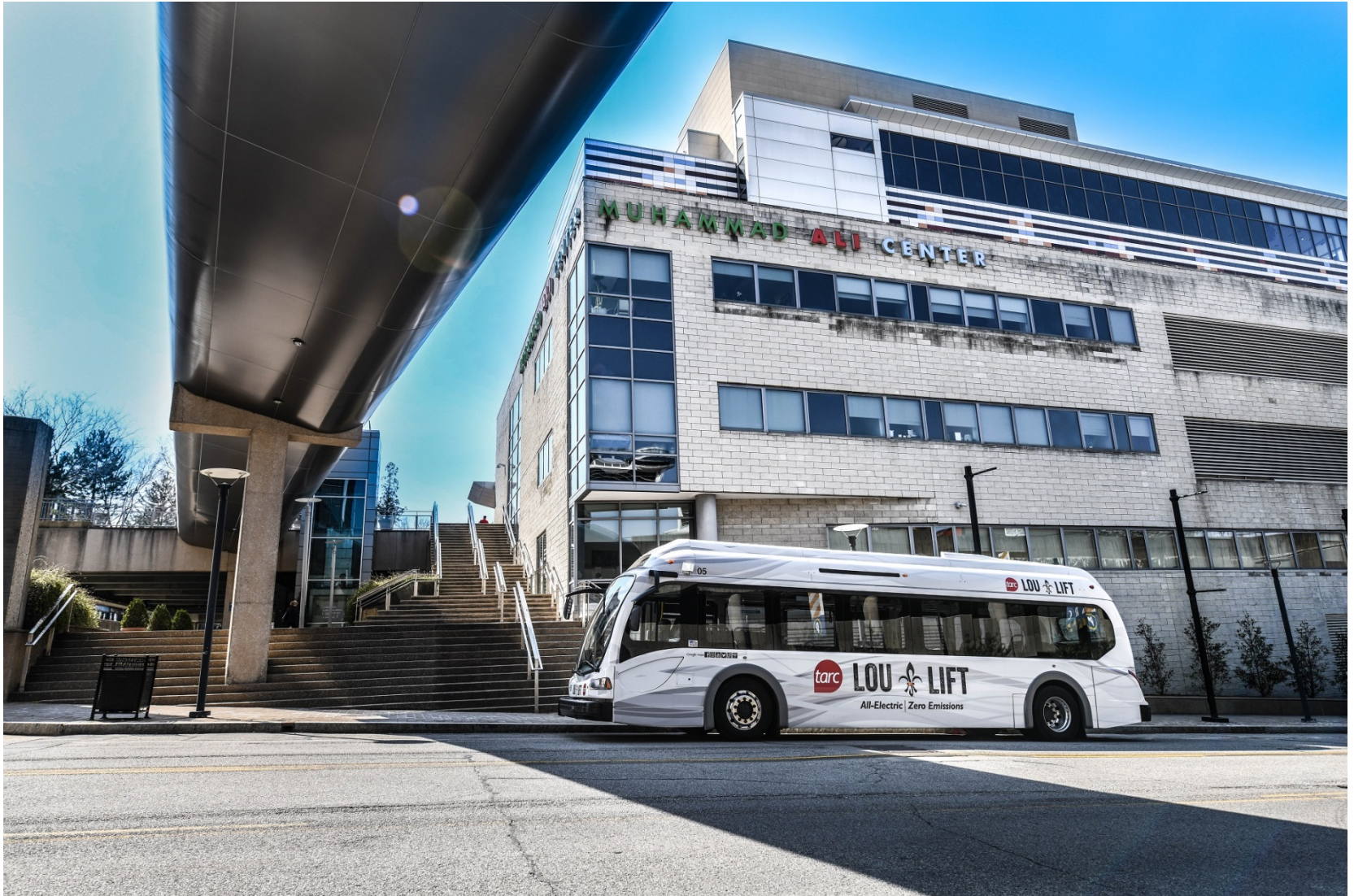
A 2013 Hybrid