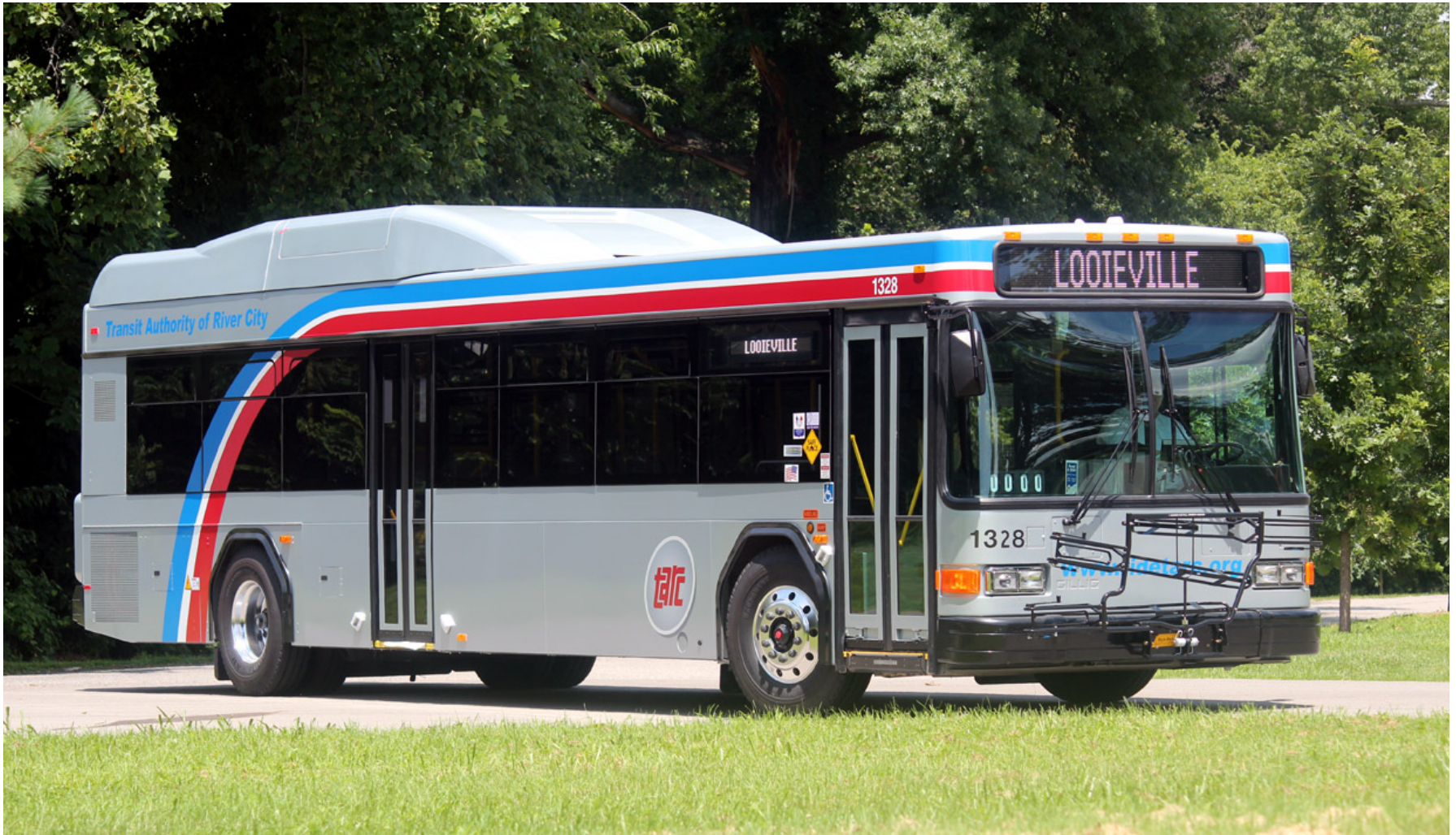
A 2013 Hybrid