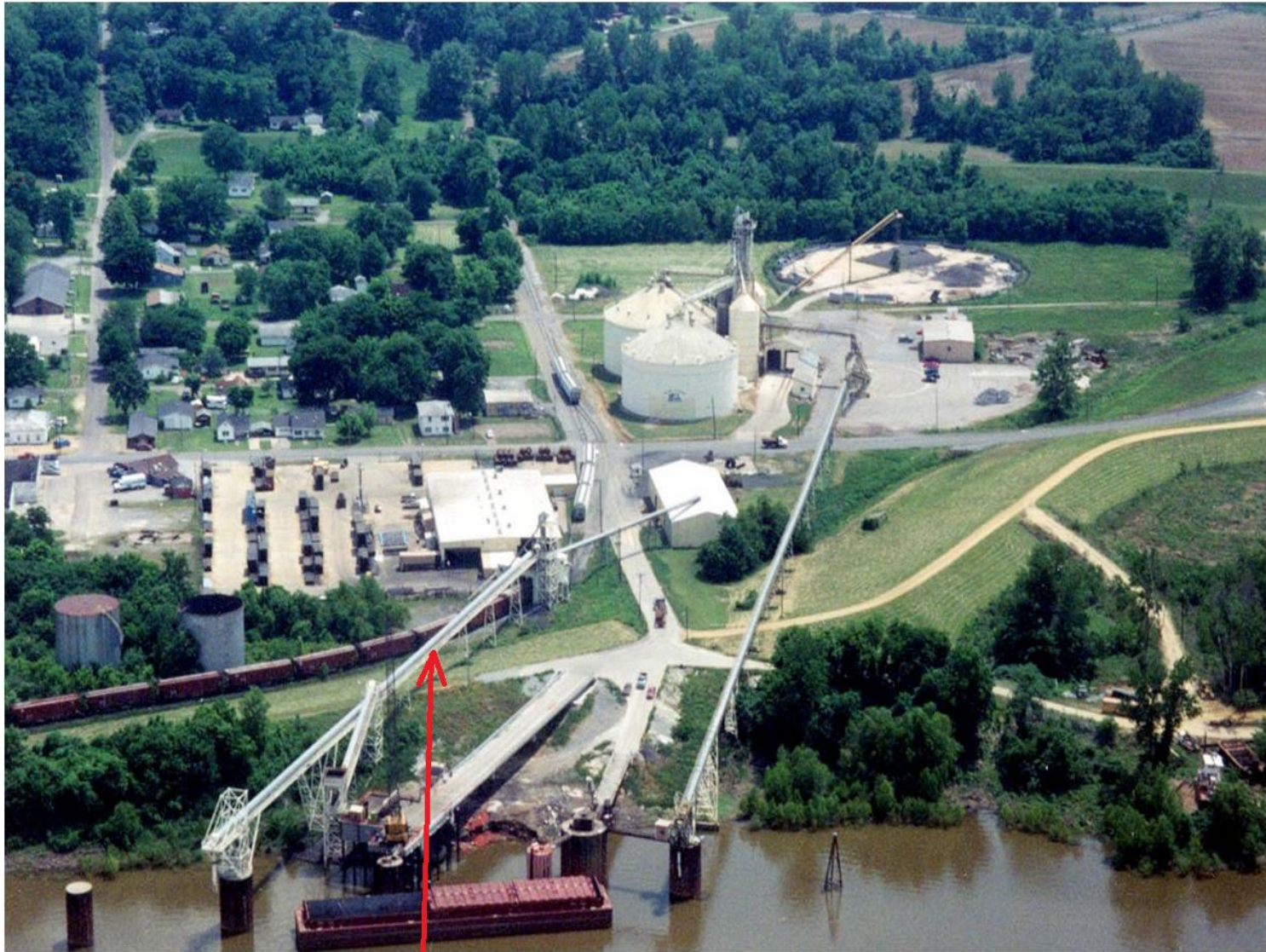
Conveyor Upgrade Project Conveyor