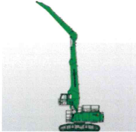
Green Hybrid 865 R-HD E-Series