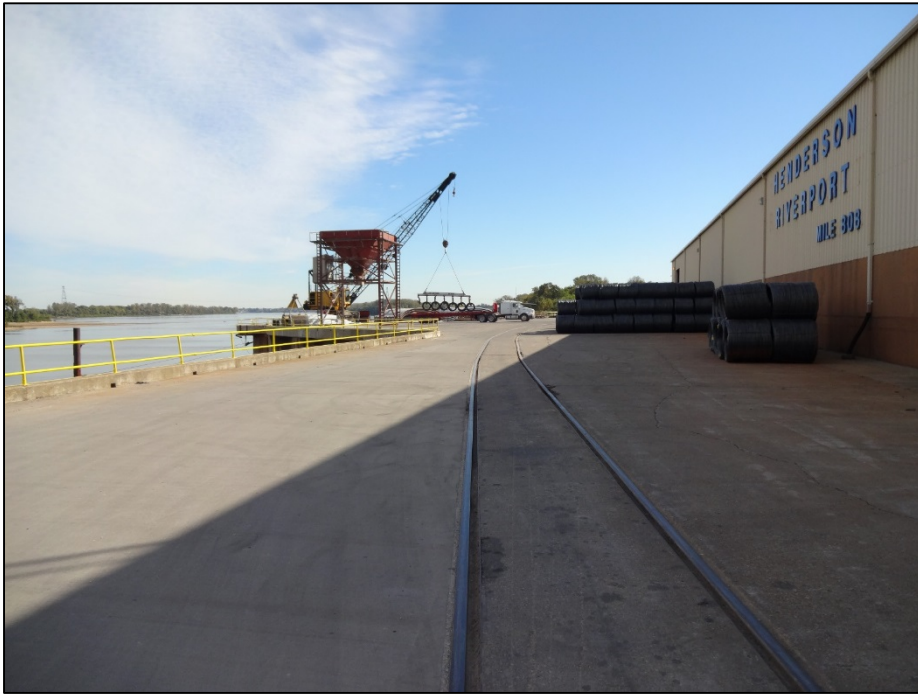
Dock Rehab Henderson Riverport