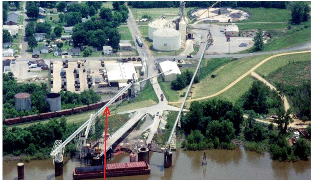
Conveyor Upgrade Project Conveyor

The intent of this project is to upgrade the bucket lift and crossover conveyor to double the loading capacity to 30,000 bushels of grain per hour.