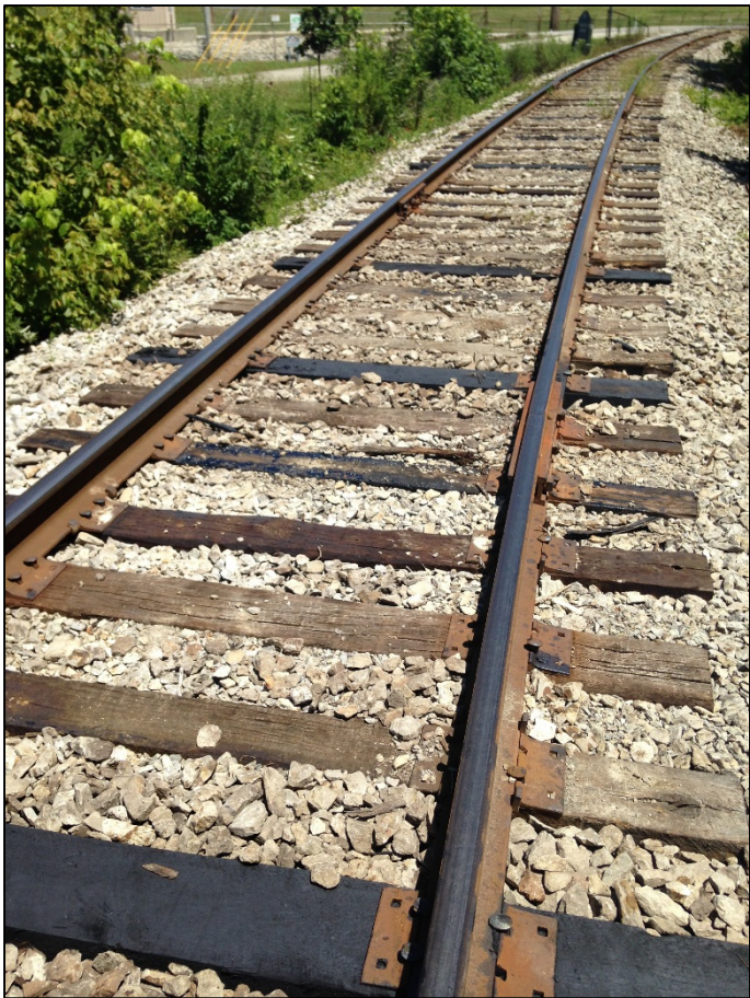
Rail Rehab Louisville Riverport