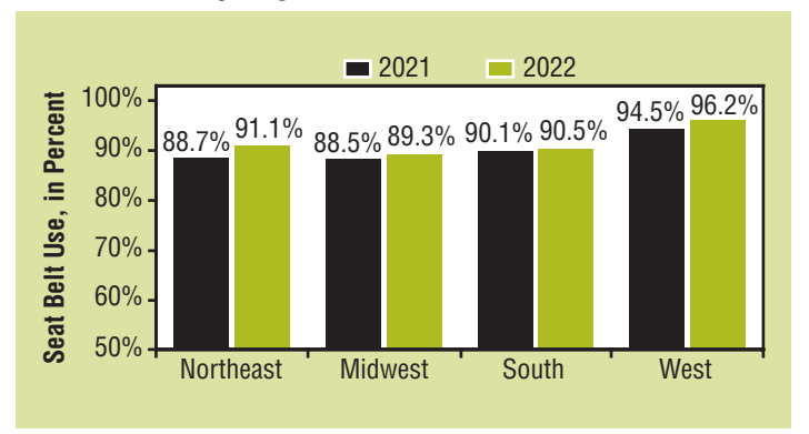
Figure 2 Seat Belt Use by Region