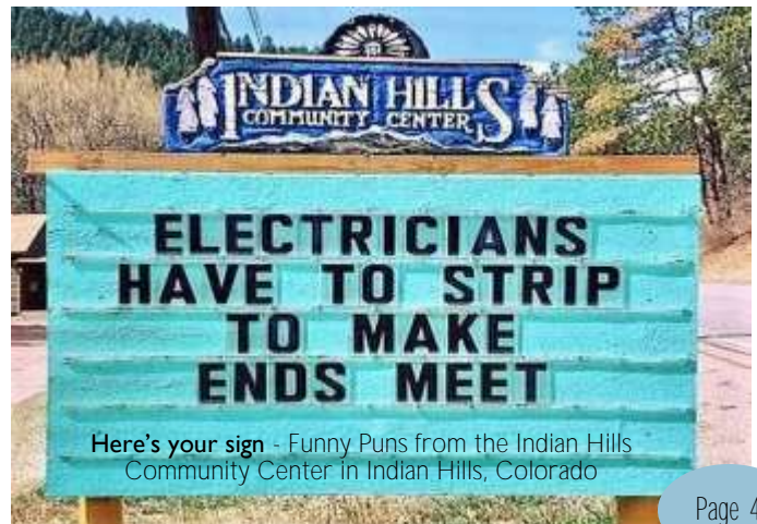
Here's your sign - Funny Puns from the Indian Hills Community Center in Indian Hills, Colorado