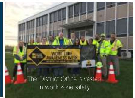
The District Office is vested in work zone safety