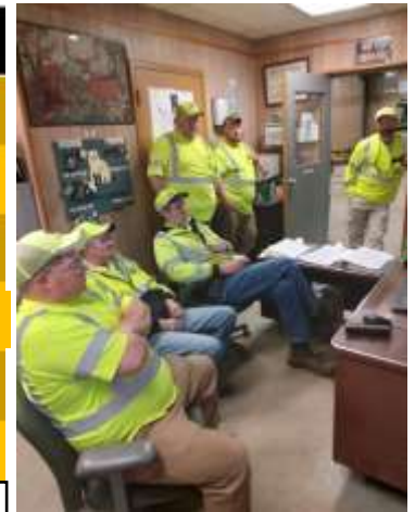
Bracken County Crew 364 watch a safety video.

In 2021, District 6 had a total of 224 collisions. 184 of those were in construction work zones and 40 in maintenance/utility work zones. Of the 224, 187 happened during the daytime and 37 at nighttime.