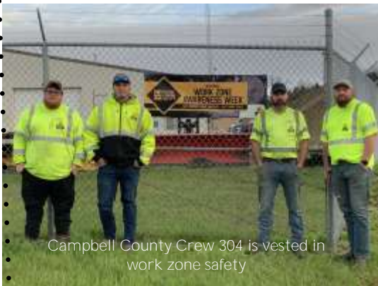
Campbell County Crew 304 is vested in work zone safety

Prevent work zones crashes, injuries and fatalities on Kentucky roadways.