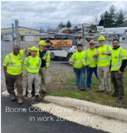
Boone County Crew 342 is vested in work zone safety

National Work Zone Awareness Week was April 11-15, 2022 . Every year, Departments of Transportation nationwide participate in daily events to promote safer work zones. Whether behind a barrel or the wheel, we all have a vested interest to keep work zones safe.