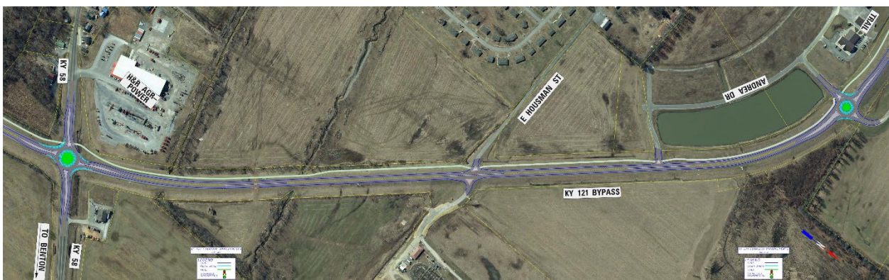
KY 58 Roundabout and Andrea Drive Roundabout

The last roundabout will be located at Andrea Drive. The section of roadway between KY 58 and Andrea Drive, we have proposed right- in and right-out access at Housman St and field entrances along the corridor.