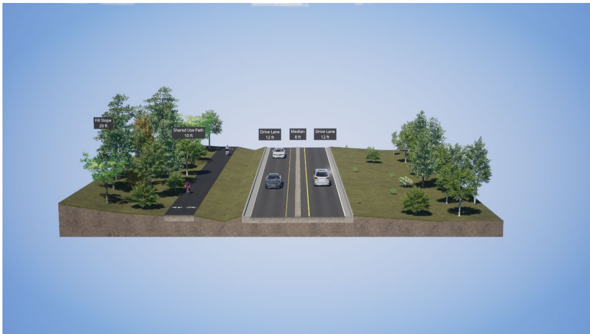
Proposed Roadway Typical Section

Proposed Improvements: The project will rework the existing pavements footprint to discourage speeding, accommodate all road users, and create an overall safer and more pleasant roadway. Overall improvements include roundabouts at Charles Drive, KY 58, KY 464, and Andrea Drive. Elsewhere along the corridor access will be limited to right-in, right-out movements, with the roundabouts providing U-turn access back to other destinations. There will be a multi-use trail adjacent to the roadway.