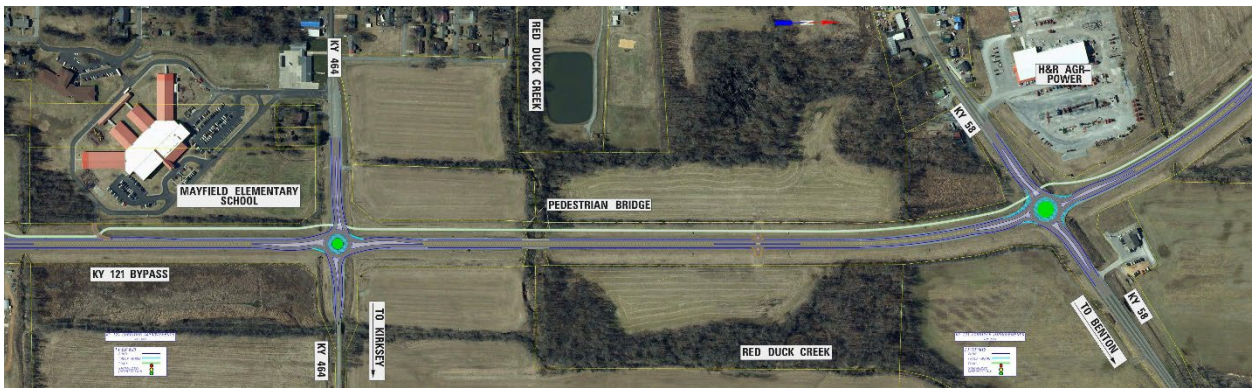
KY 464 Roundabout and KY 58 Roundabout

As you traverse the corridor headed North, there are a series of right-in and right-out entrances to the business along KY 121. The next two roundabouts will be located at KY 464 and KY 58. The team has proposed a right in only entrance at Mayfield Elementary School to allow buses to enter from KY 121 for bus drop off and pick-up.