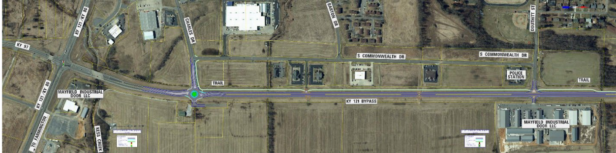
Roundabout at Charles Drive and KY 121 to MIDCo LLC

As you traverse the corridor headed North, there are a series of right-in and right-out entrances to the business along KY 121. The next two roundabouts will be located at KY 464 and KY 58. The team has proposed a right in only entrance at Mayfield Elementary School to allow buses to enter from KY 121 for bus drop off and pick-up.