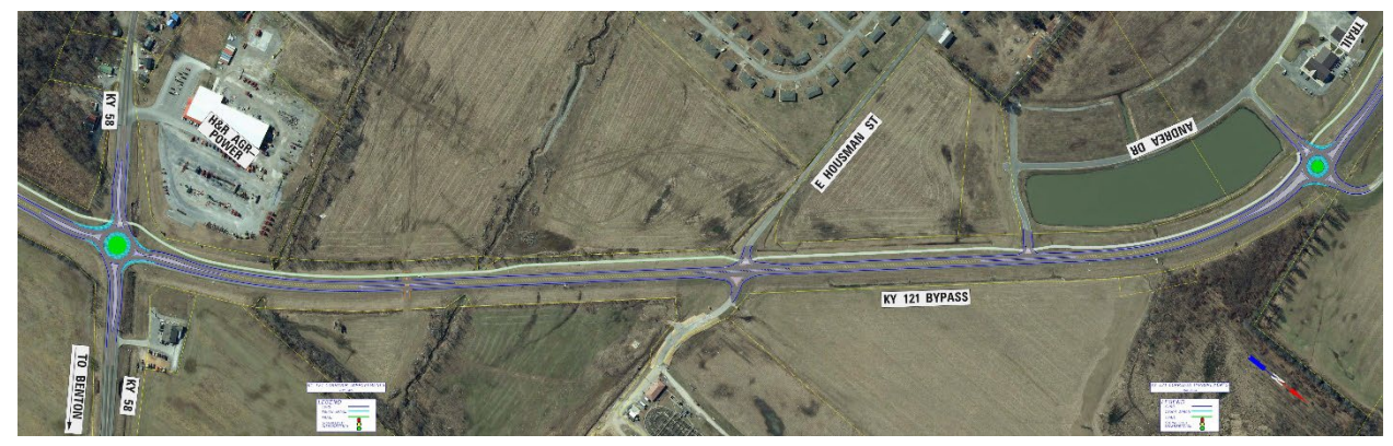
KY 58 Roundabout and Andrea Drive Roundabout

The last roundabout will be located at Andrea Drive. The section of roadway between KY 58 and Andrea Drive, we have proposed right- in and right-out access at Housman St and field entrances along the corridor.