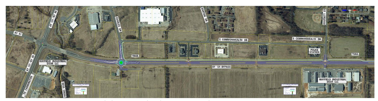
Roundabout at Charles Drive and KY 121 to MIDCo LLC

The first of the series of roundabouts will be located at Charles Drive.