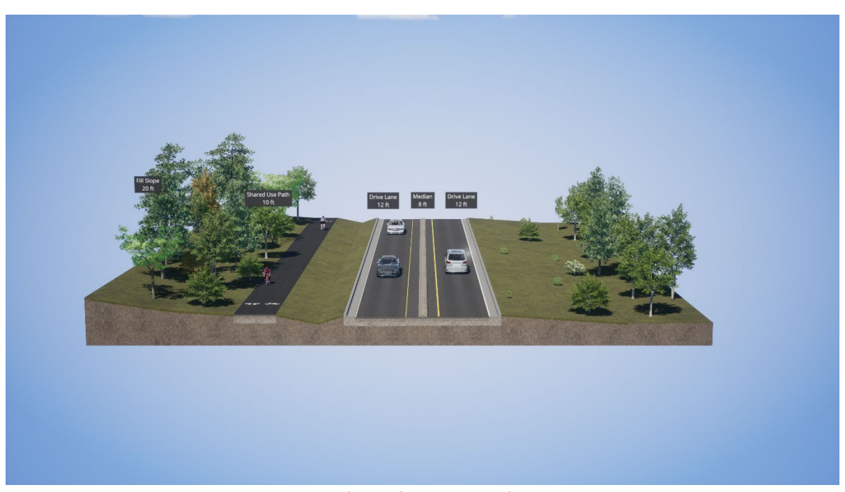
Proposed Roadway Typical Section

Proposed Improvements: The project will rework the existing pavements footprint to discourage speeding, accommodate all road users, and create an overall safer and more pleasant roadway. Overall improvements include roundabouts at Charles Drive, KY 58, KY 464, and Andrea Drive. Elsewhere along the corridor access will be limited to right-in, right-out movements, with the roundabouts providing U-turn access back to other destinations. There will be a multi-use trail adjacent to the roadway.