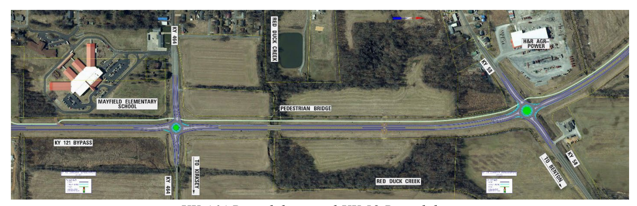
KY 464 Roundabout and KY 58 Roundabout

As you traverse the corridor headed North, there are a series of right-in and right-out entrances to the business along KY 121. The next two roundabouts will be located at KY 464 and KY 58. The team has proposed a right in only entrance at Mayfield Elementary School to allow buses to enter from KY 121 for bus drop off and pick-up.