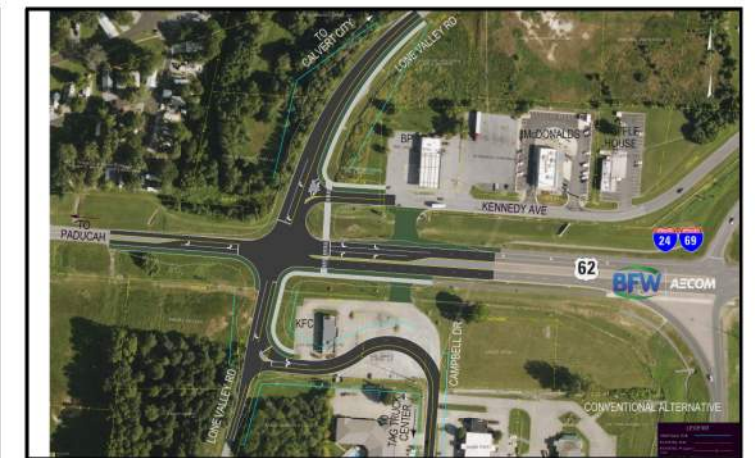
ALTERNATE 2 "CONVENTIONAL" TYPE INTERSECTION EXTENDING KENNEDY AVENUE