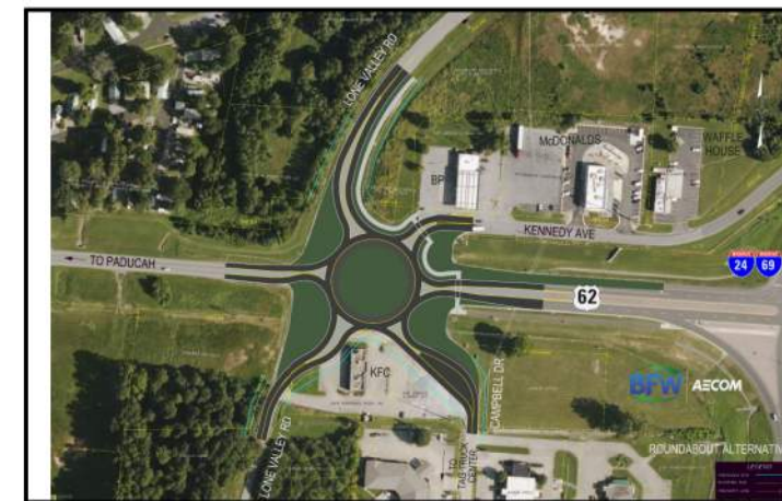
ALTERNATE 1 ROUNDBABOUT