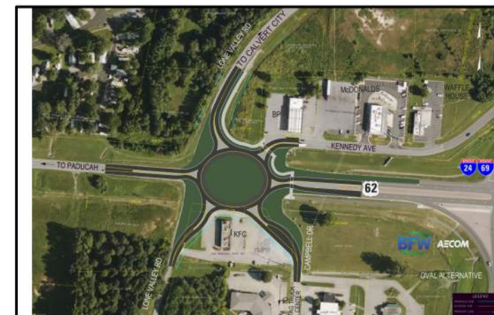
ALTERNATE 3 "OVAL" ROUNDBABOUT