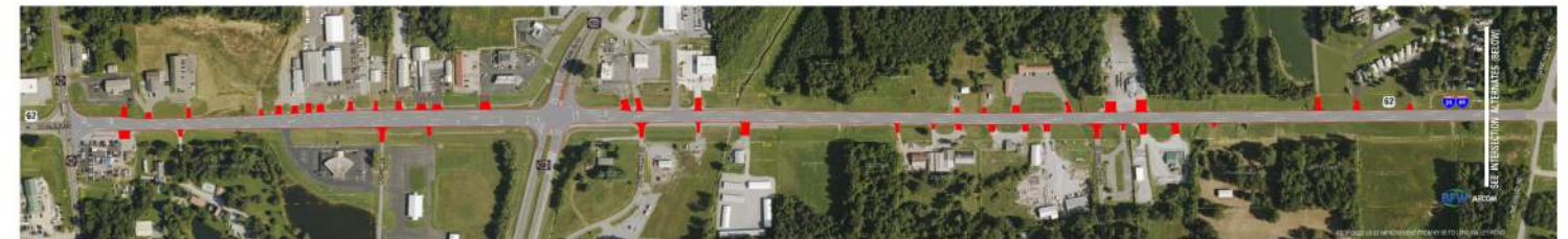
US 62 CORRIDOR IMPROVEMENTS