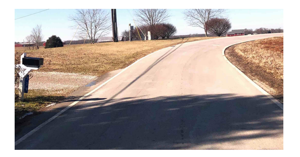
Old East Hardin Middle School Gym College Street Glendale, KY August 11, 2022 5:00-7:30 PM