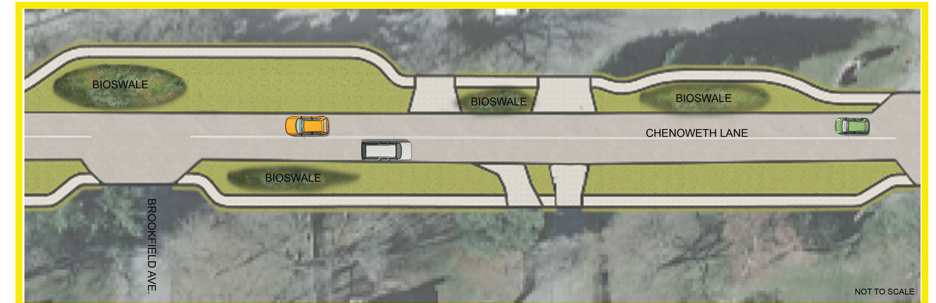
ENLARGED PLAN OF BIOSWALES IN AREA B