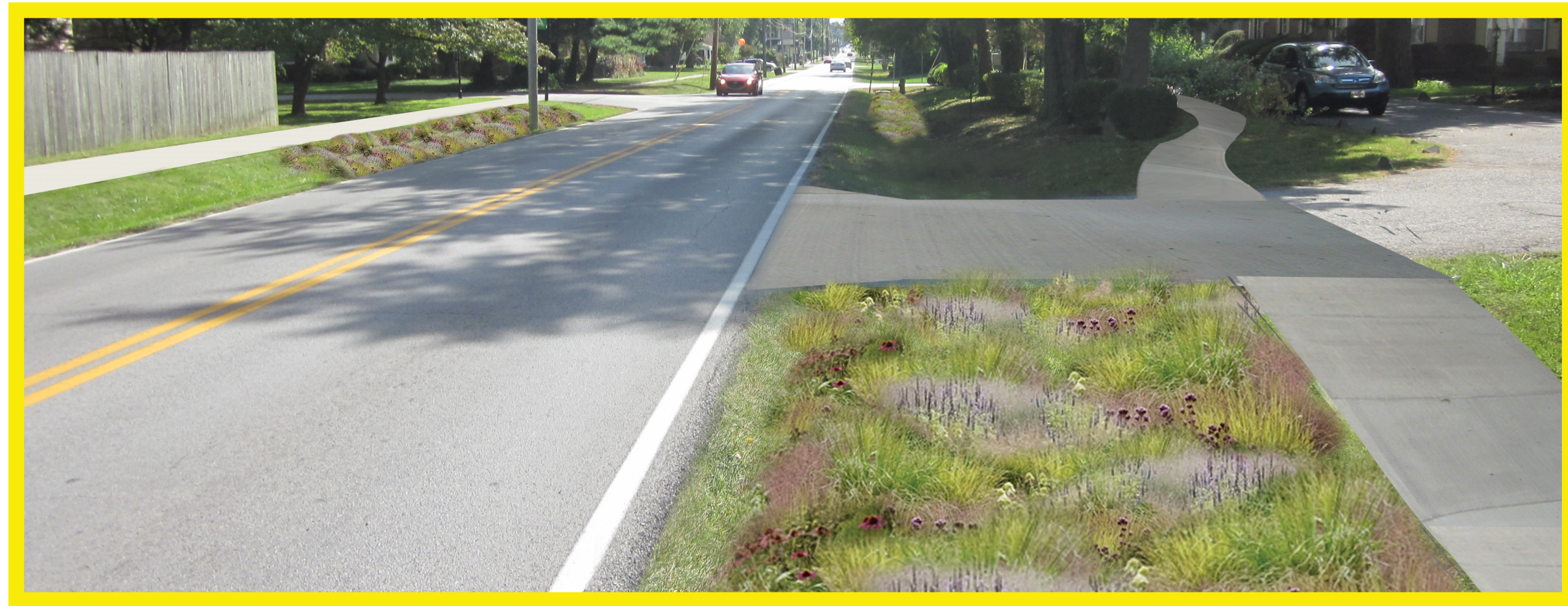
BIOSWALE EXAMPLE IN AREA B