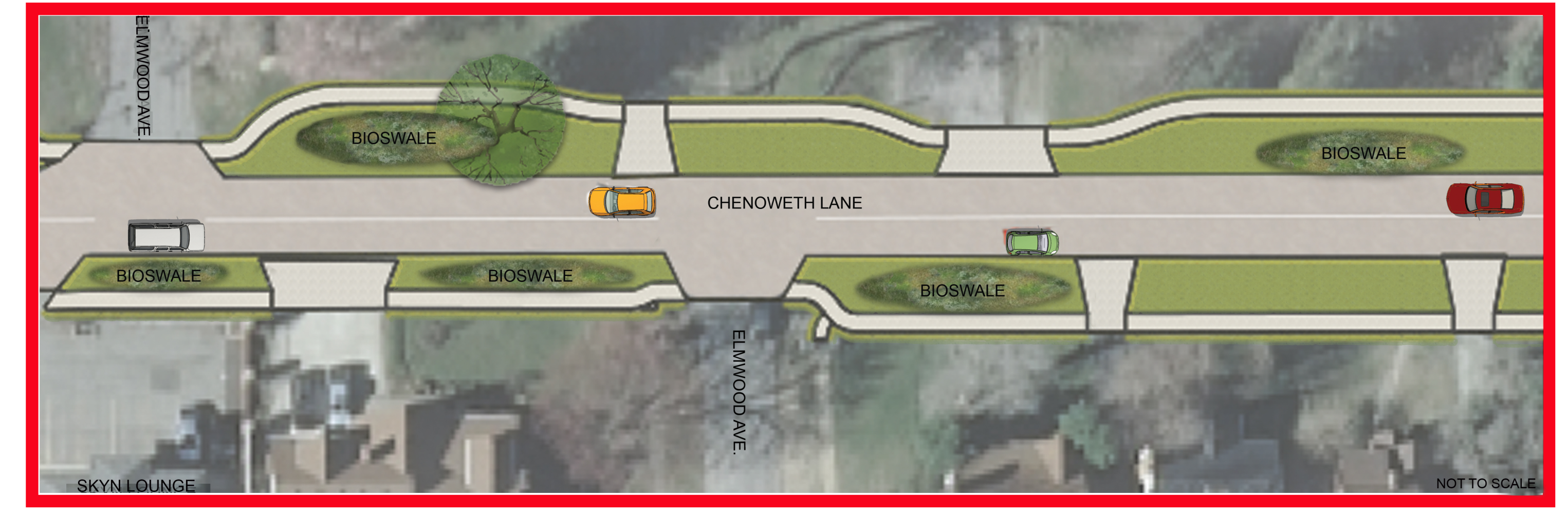
ENLARGED PLAN OF BIOSWALES IN AREA A