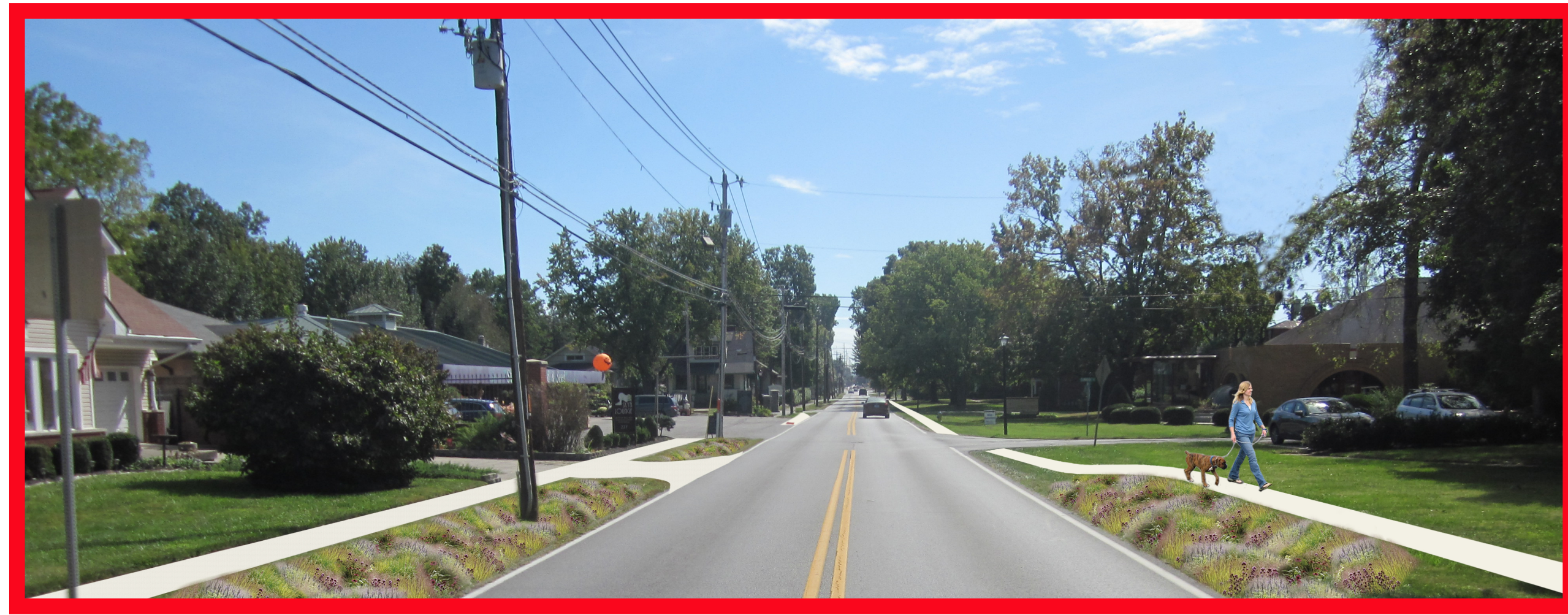
RENDERING OF AREA A