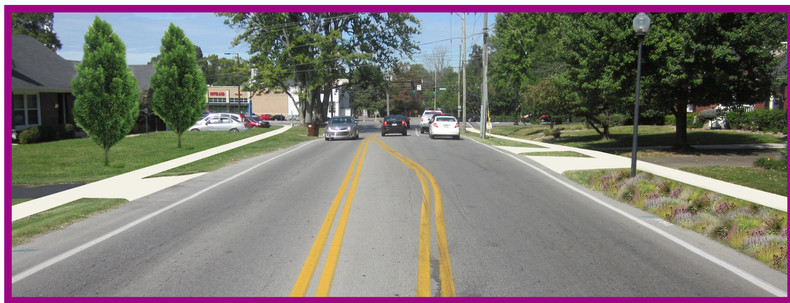
RENDERING OF AREA C