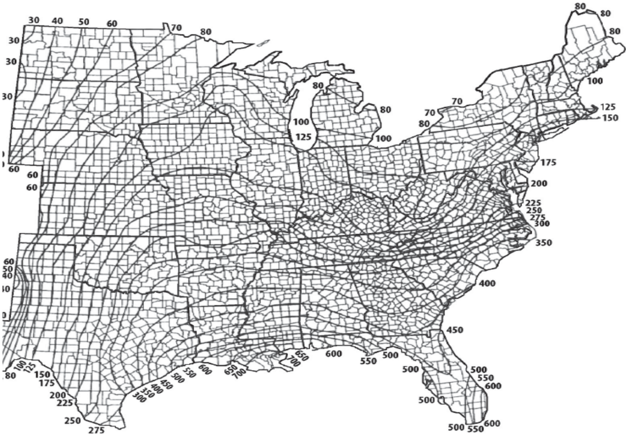
Figure 2. Isoerodent Map of the Eastern U.S.

PART III Page III-7 Permit No: KYR100000 AI NO.: 35050