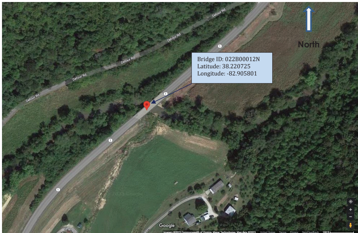
Figure 1. Google Image showing Project Site.

This report addresses the geotechnical considerations for Bridge 022B00012N, KY-1 over Little Fork Little Sandy River, located in Carter County, Kentucky. The existing bridge over Little Fork Little Sandy River is a three-span structure measuring approximately 160 feet in length. The bridge location is presented on Figure 1 below.