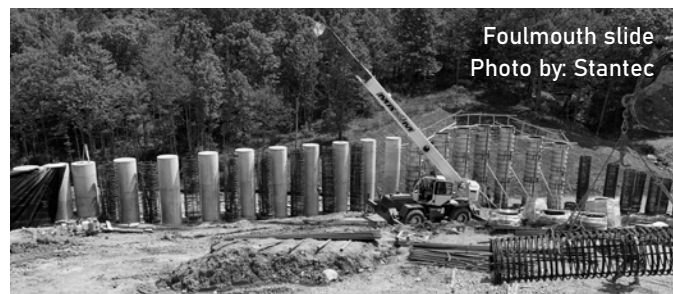
Foulmouth slide