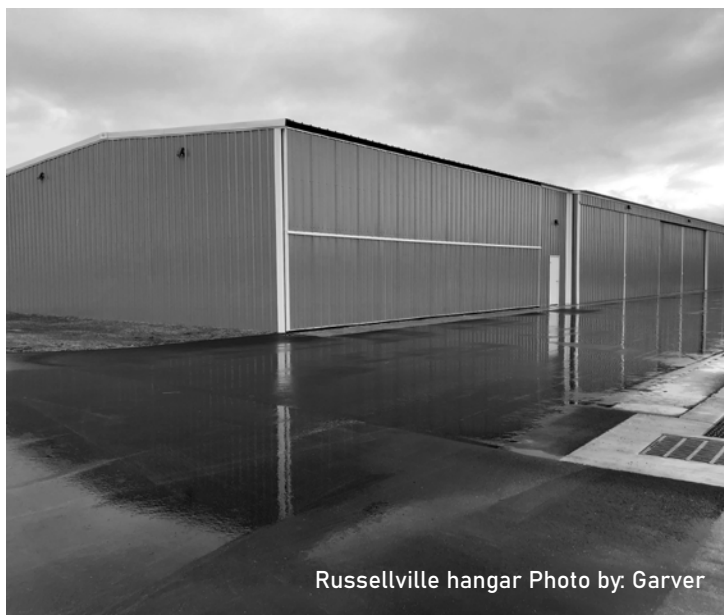
Russellville hangar