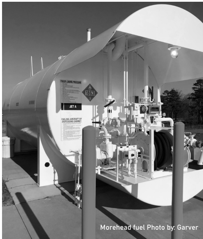
Morehead fuel