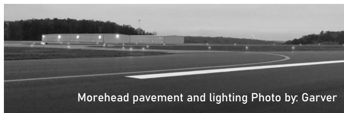
Morehead pavement and lighting

Statewide Aviation Pavement Specification Program