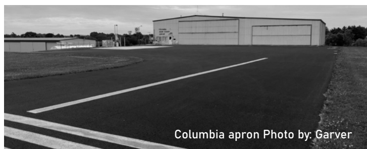
Columbia apron

*will be completed by KDA staff with a KYTC Master Agreement