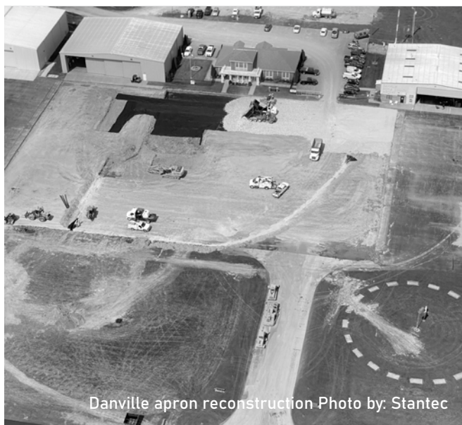
Danville apron reconstruction

Even with the reduction in the Jet Fuel Tax collected during the past year of COVID, Jake Dahl and the KDA team have optimized the tax dollars collected and are getting a sizable number of airport improvement projects designed and/or started across the Commonwealth this construction season. It is refreshing to see all the positive economic activity after the uncertainty of COVID.