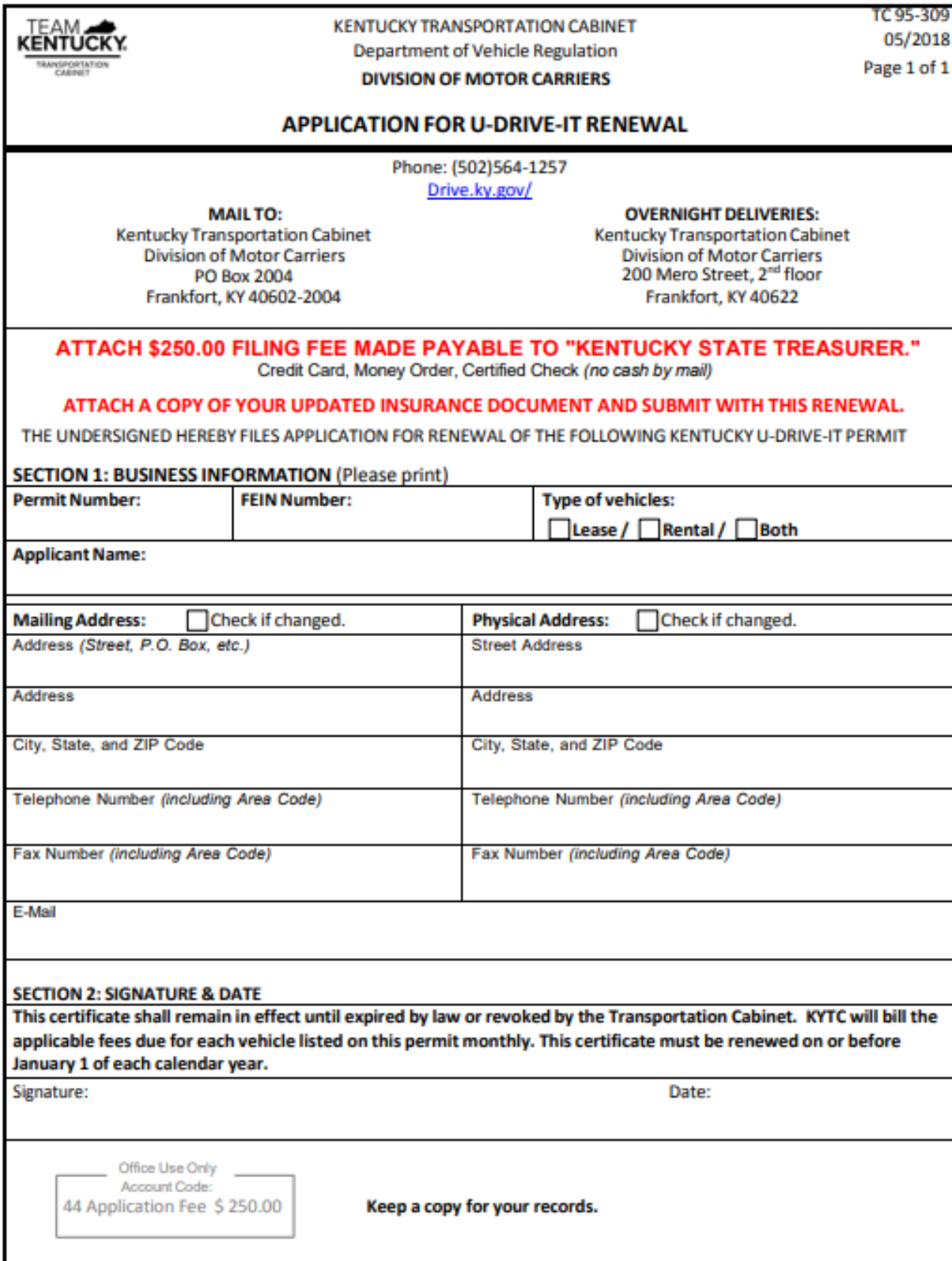
EXHIBIT 2 — APPLICATION FOR U-DRIVE-IT RENEWAL