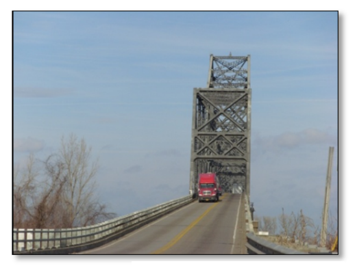
Narrow lanes and shoulders

Currently the bridge is allowed to carry legal loads, but permit loads (i.e. oversize or overweight vehicles) are not allowed. Under the no-build scenario it is anticipated the bridge would be closed to truck traffic around 2025 and closed to all traffic around 2030.