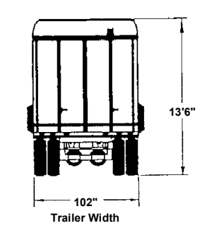
Increased Dimension Trucks (STAA Vehicles)