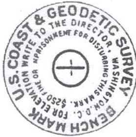
BENCH (Old Type)