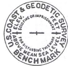
BENCH (Old Type)