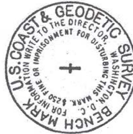
BENCH (New Type)