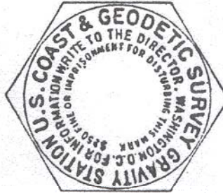
GRAVITY (Old Type)