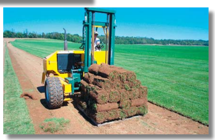
Rolled sod should be moist, flexible, green, and fresh. For best results, install as soon as possible after final grade is established.

Use sod in ditches and around drop inlets for superior protection against scouring flows. Sod slows down concentrated flows and promotes filtration and settling of sediment-laden runoff.