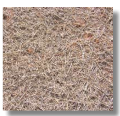
Visually inspect mulched areas to ensure uniform, sufficient coverage. Application must cover all bare areas, with less than 5 percent soil showing through mulch cover.

Good use of straw mulch and grass seed in relatively flat and fairly wide swale. For more concentrated flows, triple seed the ditch and use erosion control blankets.