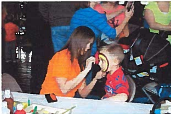
Funny Face Time!