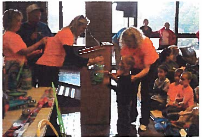
Prizes Are Fun!