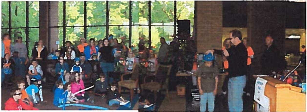
Bike Safety Education