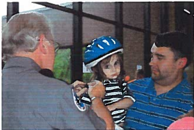
Make Sure it Fits!