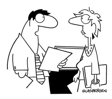
"The word 'audit' comes from 'auditory' which means 'to hear bad news coming'."