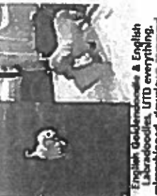
English Golden Retrievers & English Labradors. LTD everything.

SPECIFICATIONS ON THE ABOVE MENTIONED PROPOSAL MAY BE EXAMINED AT THE LOUISVILLE METRO HOUSING AUTHORITY PURCHASING DEPARTMENT LOCATED AT 3223 S. 7TH STREET RD. LOUISVILLE, KY 40216